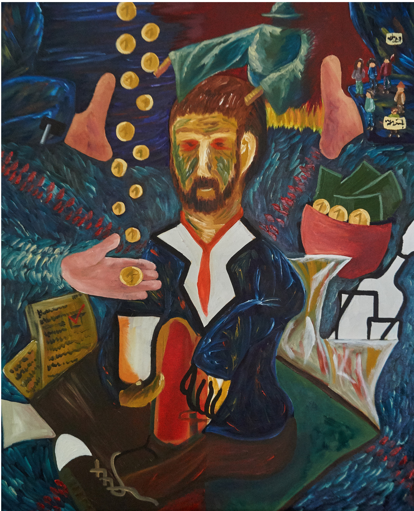
Everyone's Beggar, 2019, Oil on Canvas, 100 x 80 cm