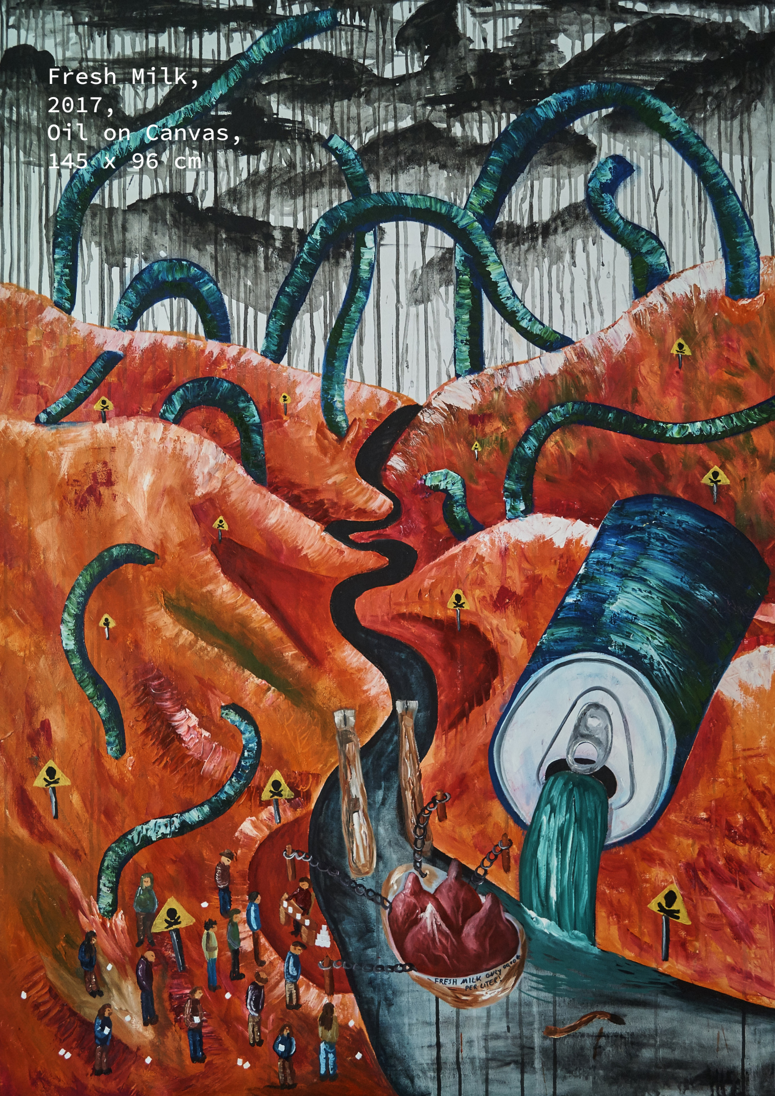
Fresh Milk, 2017, Oil on Canvas, 145 x 96 cm