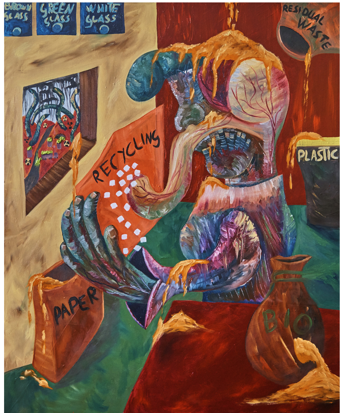
Radiant Nature, 2017, Oil on Canvas, 100 x 80 cm