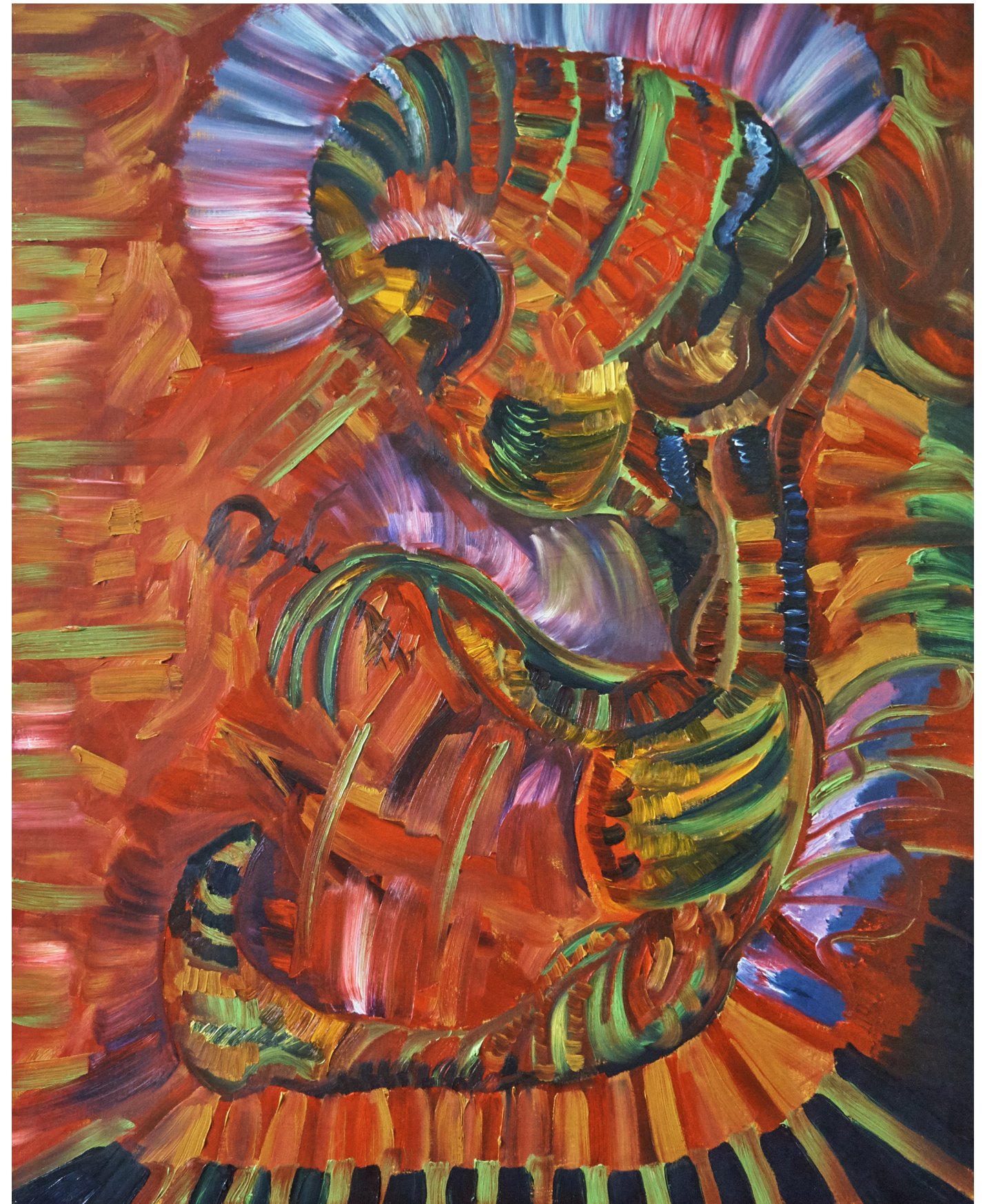
The Toy, 2015, Oil on Canvas, 100 x 80 cm