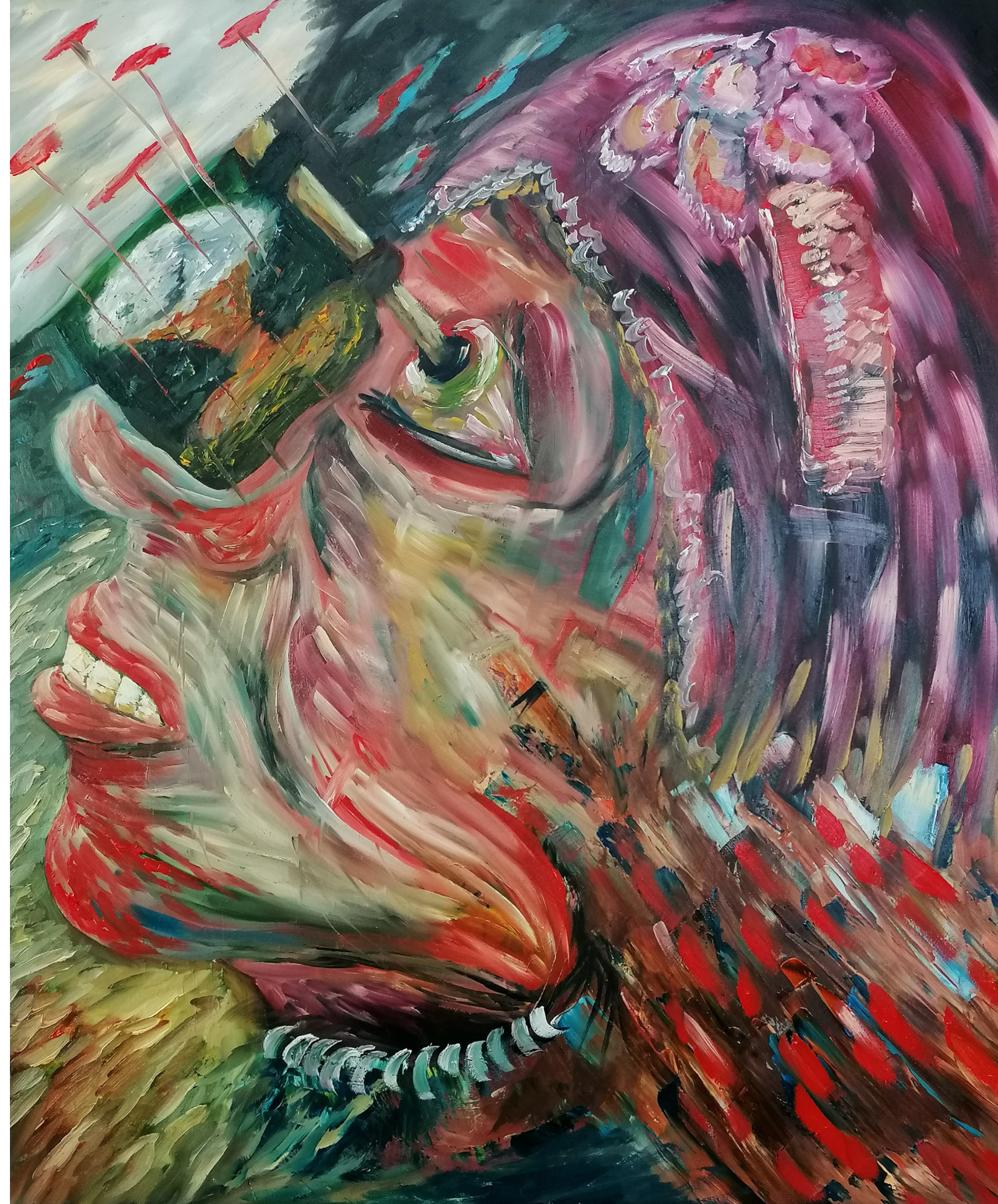
Eye Fungus, 2019, Oil on Canvas, 100 x 80 cm

„Artistic's Symphony“ – ‚d'Arte Mentana‘ – Florence, Italy