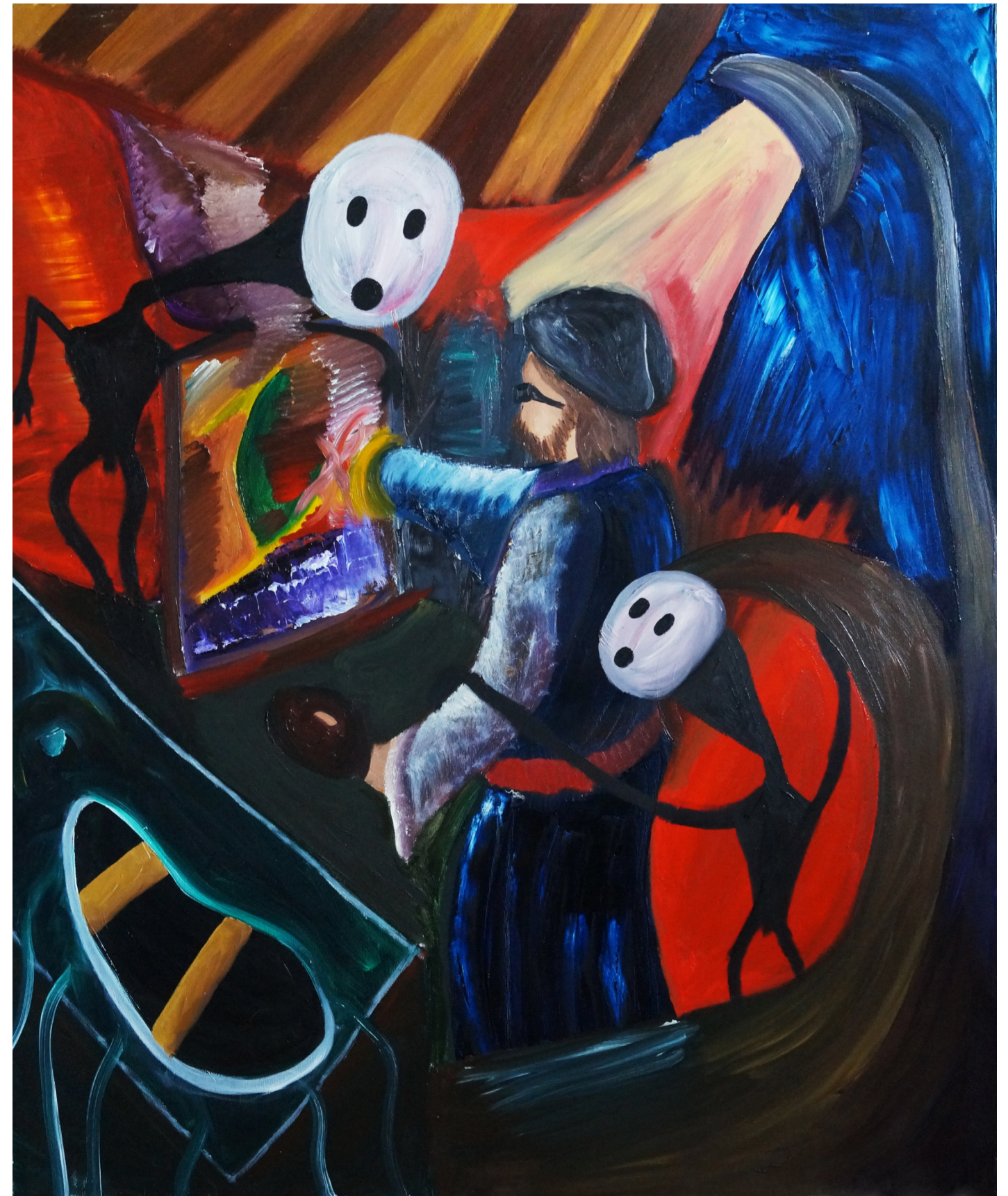
Selbstbildnis beim Malen, 2015, Oil on Canvas, 100 x 80 cm