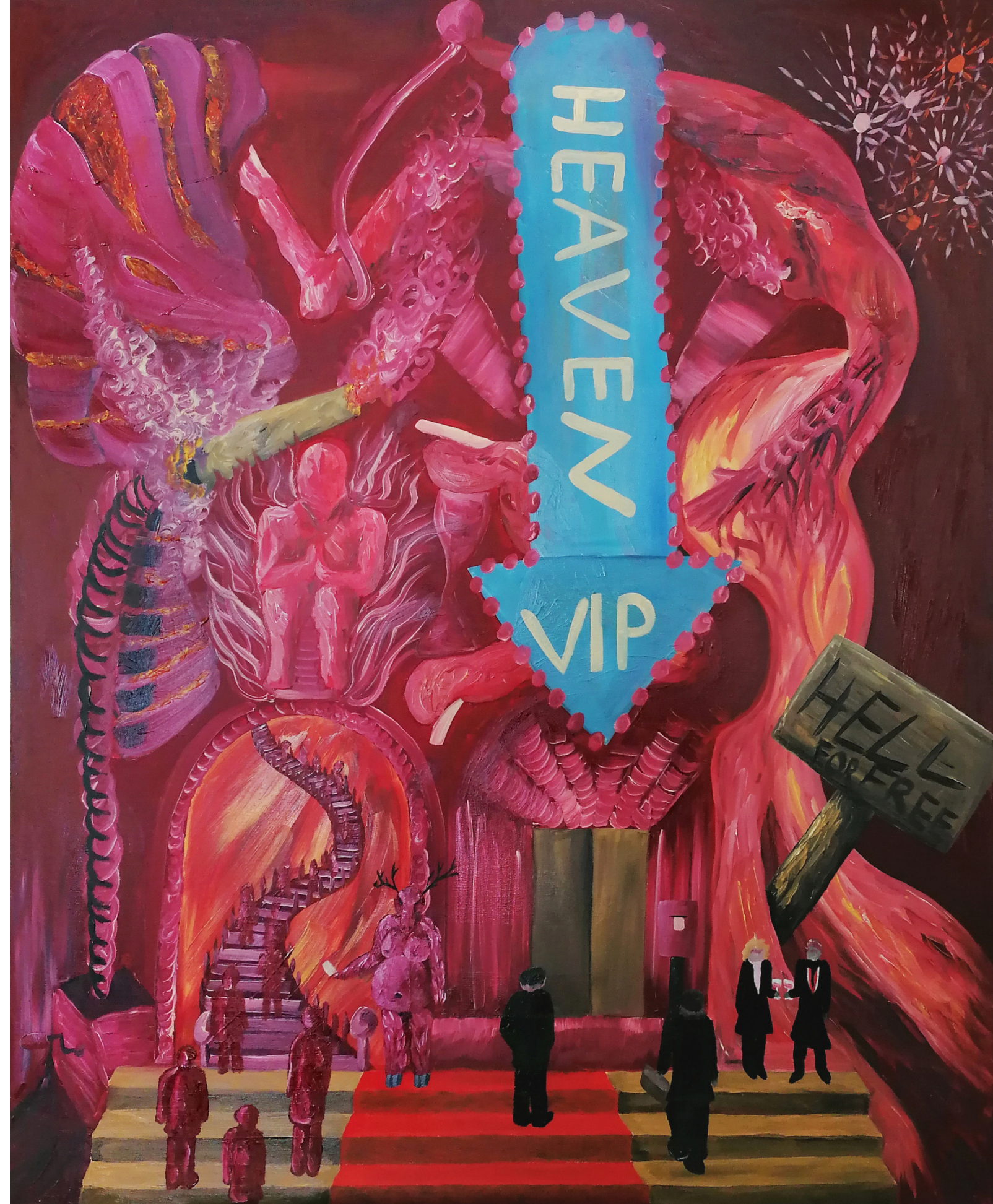
Heaven VIP Hell for FREE, 2019, Oil on Canvas, 100 x 80 cm