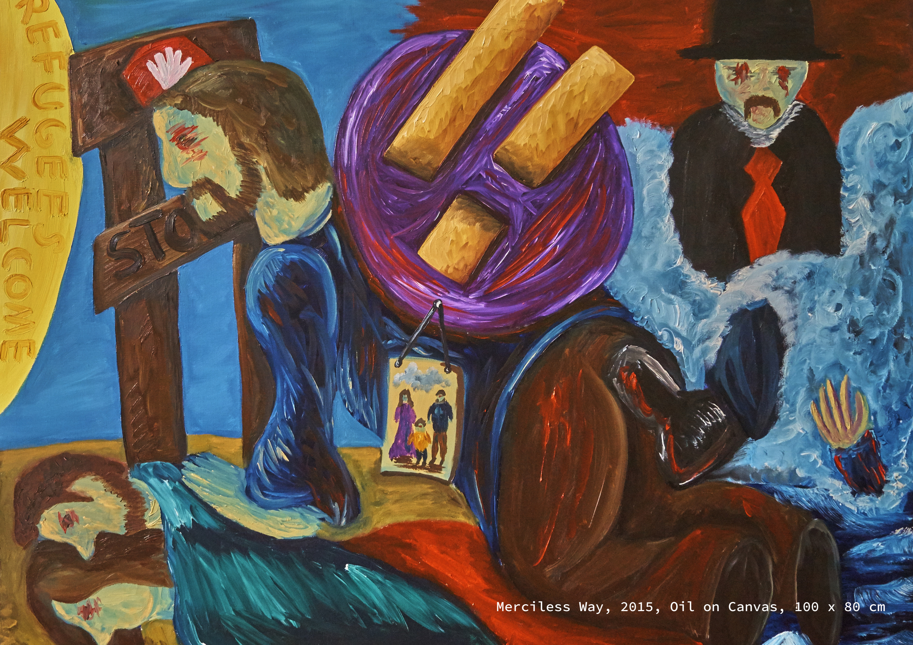
Merciless Way, 2015, Oil on Canvas, 100 x 80 cm