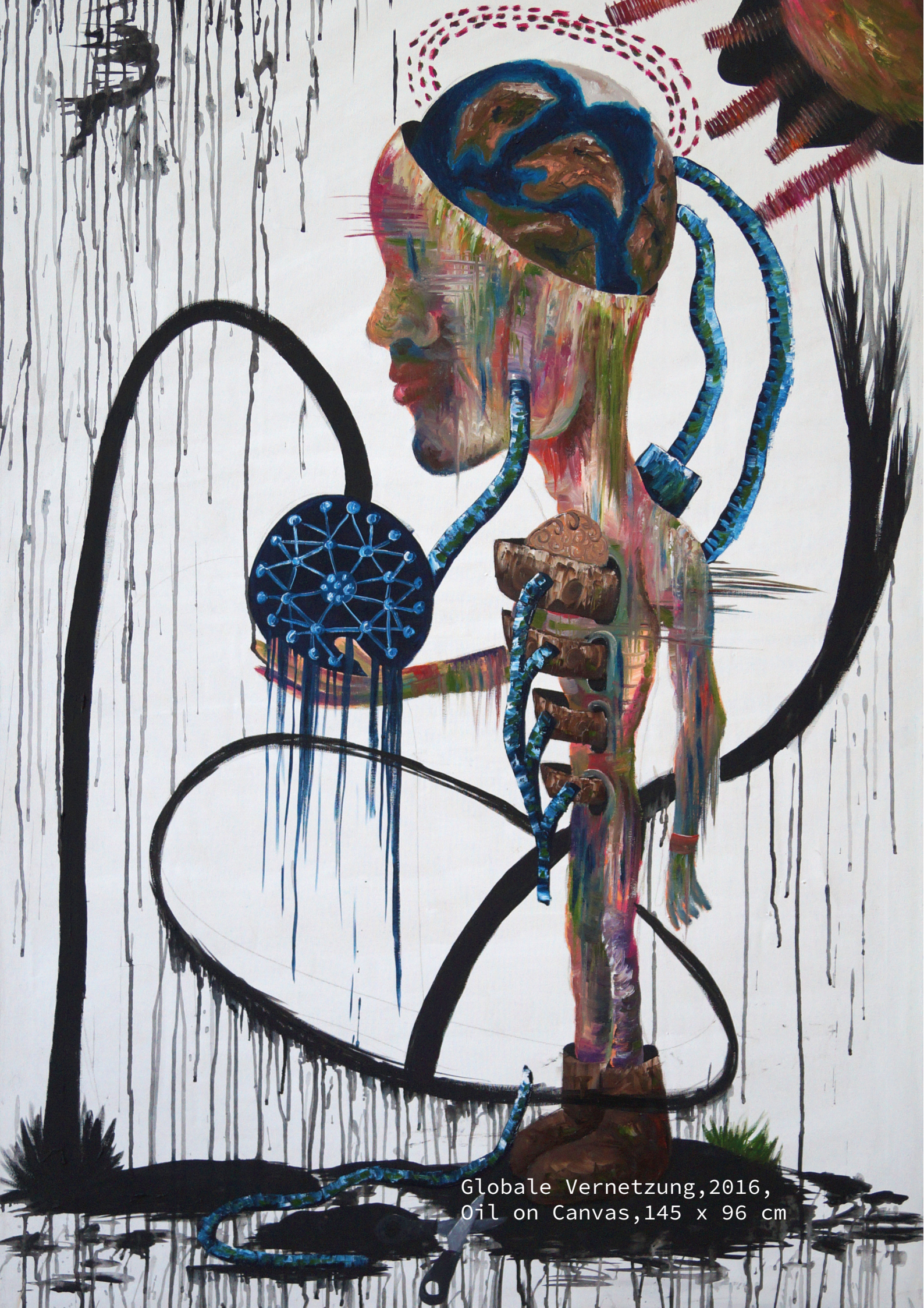
Globale Vernetzung, 2016, Oil on Canvas, 145 x 96 cm