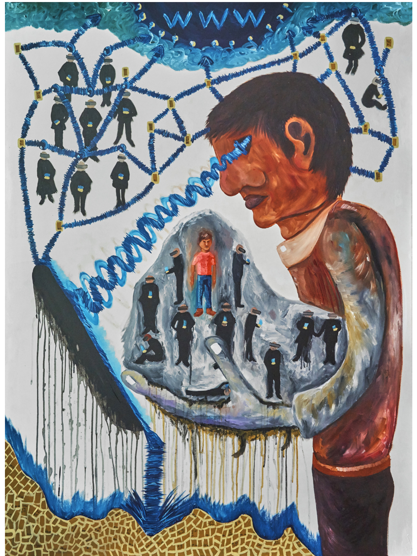
Graveyard Of Analogous Humanity, 2017, Oil on Canvas, 145 x 96 cm