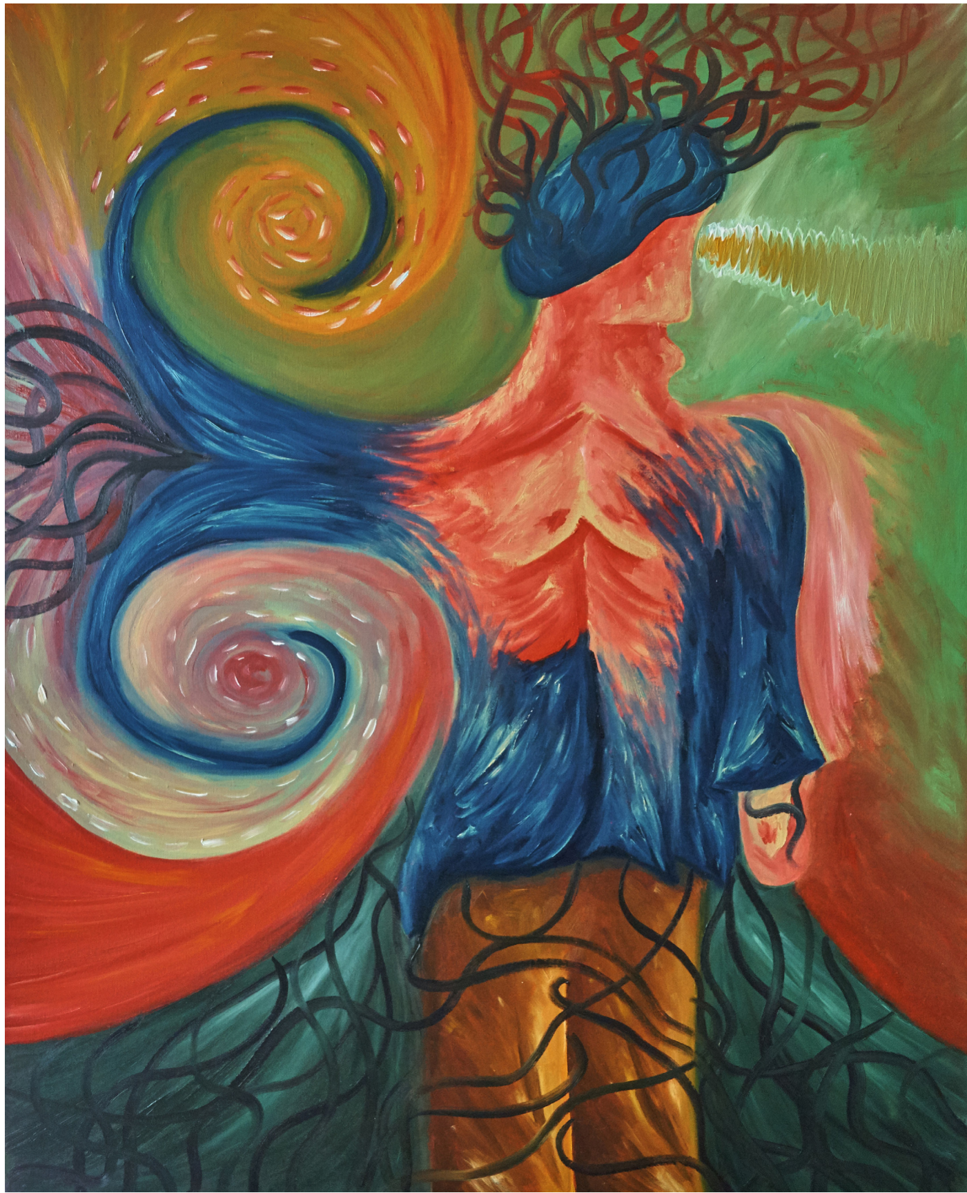
Lebensstrom, 2015, Oil on Canvas, 100 x 80 cm