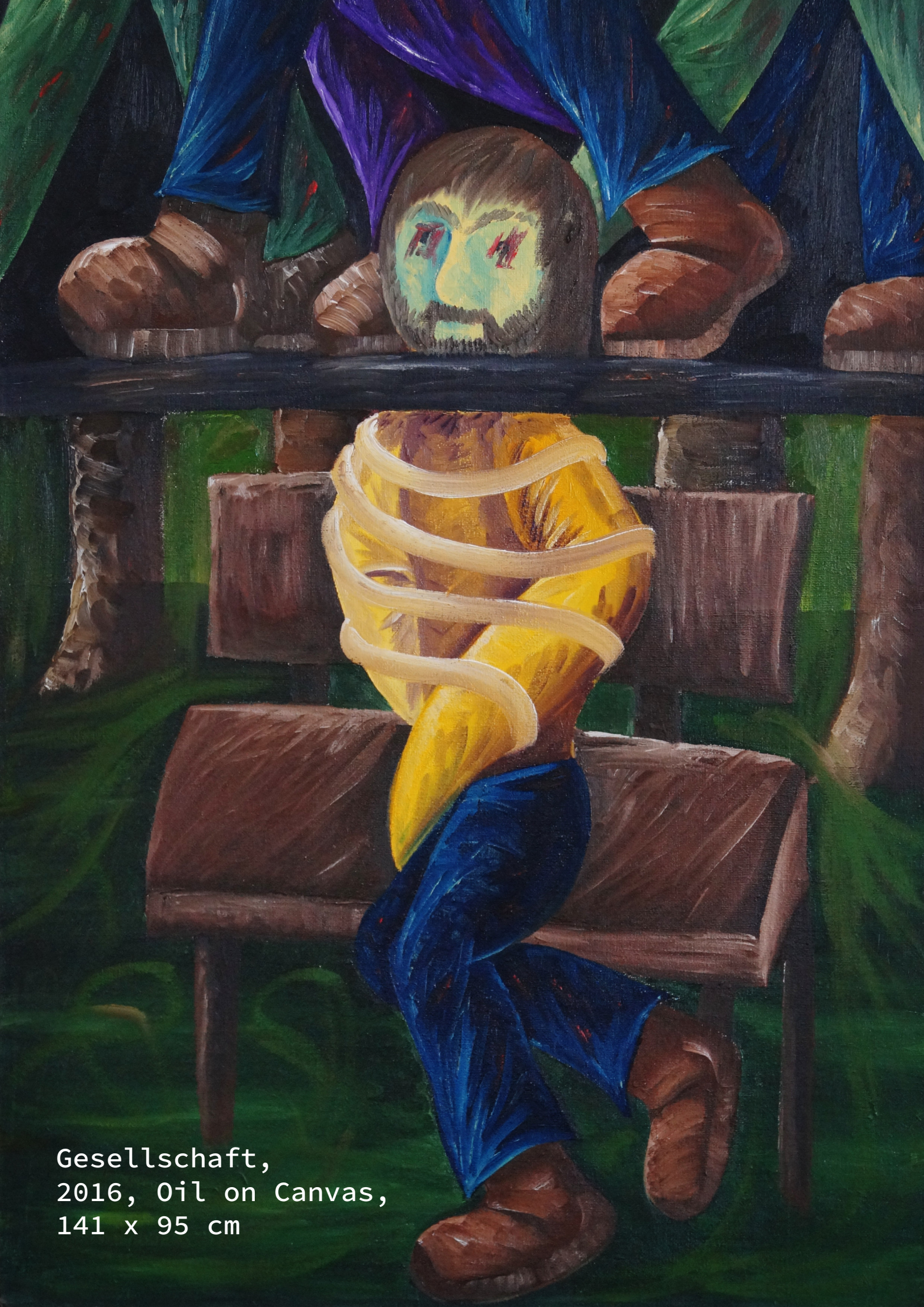
Gesellschaft, 2016, Oil on Canvas, 141 x 95 cm