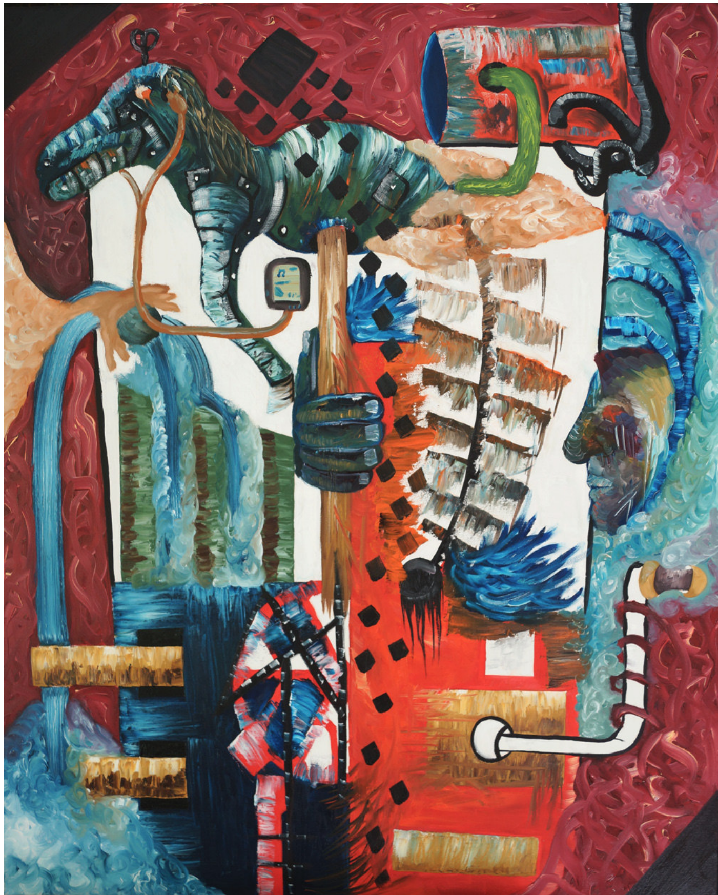
Factory of Life, 2017, Oil on Canvas, 100 x 80 cm