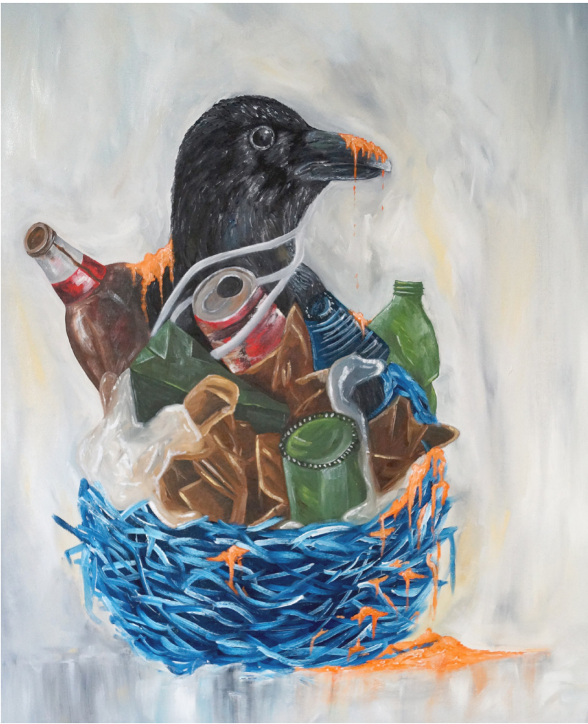
Home Sweet Home, 2017, Oil on Canvas, 80 x 60 cm