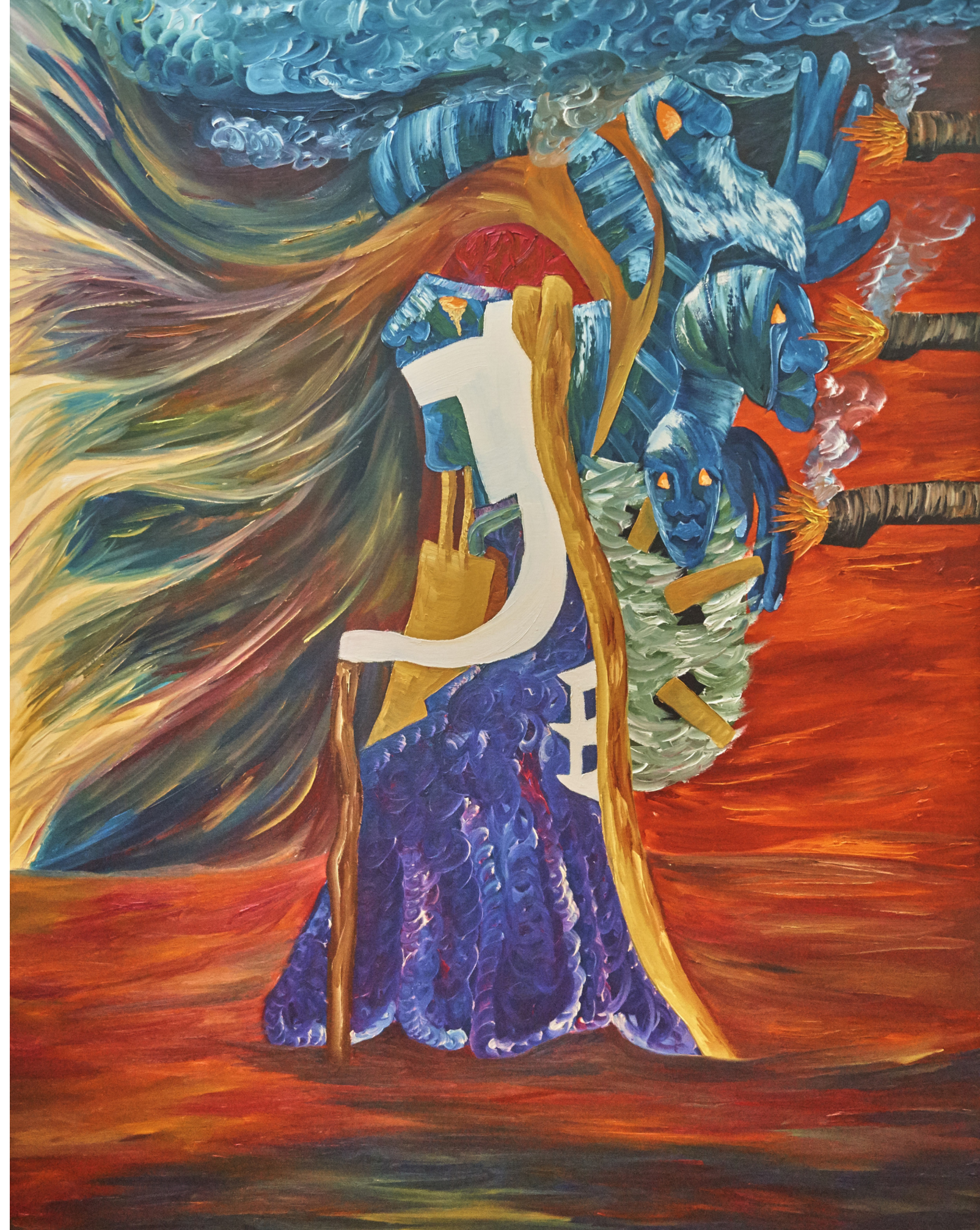
War Behind Us, 2017, Oil on Canvas, 100 x 80 cm