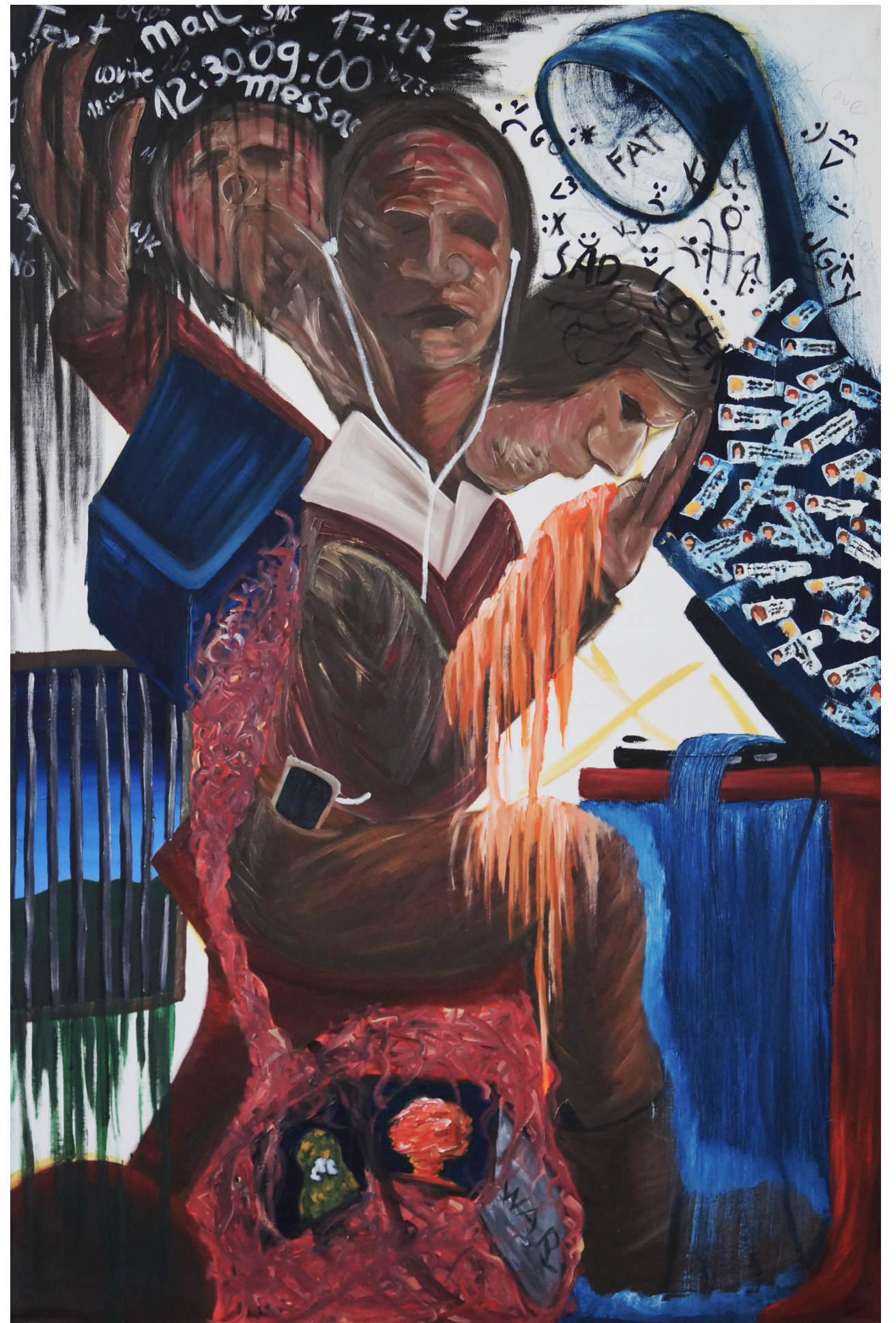
Mediengewalt, 2016, Oil on Canvas, 145 x 96 cm