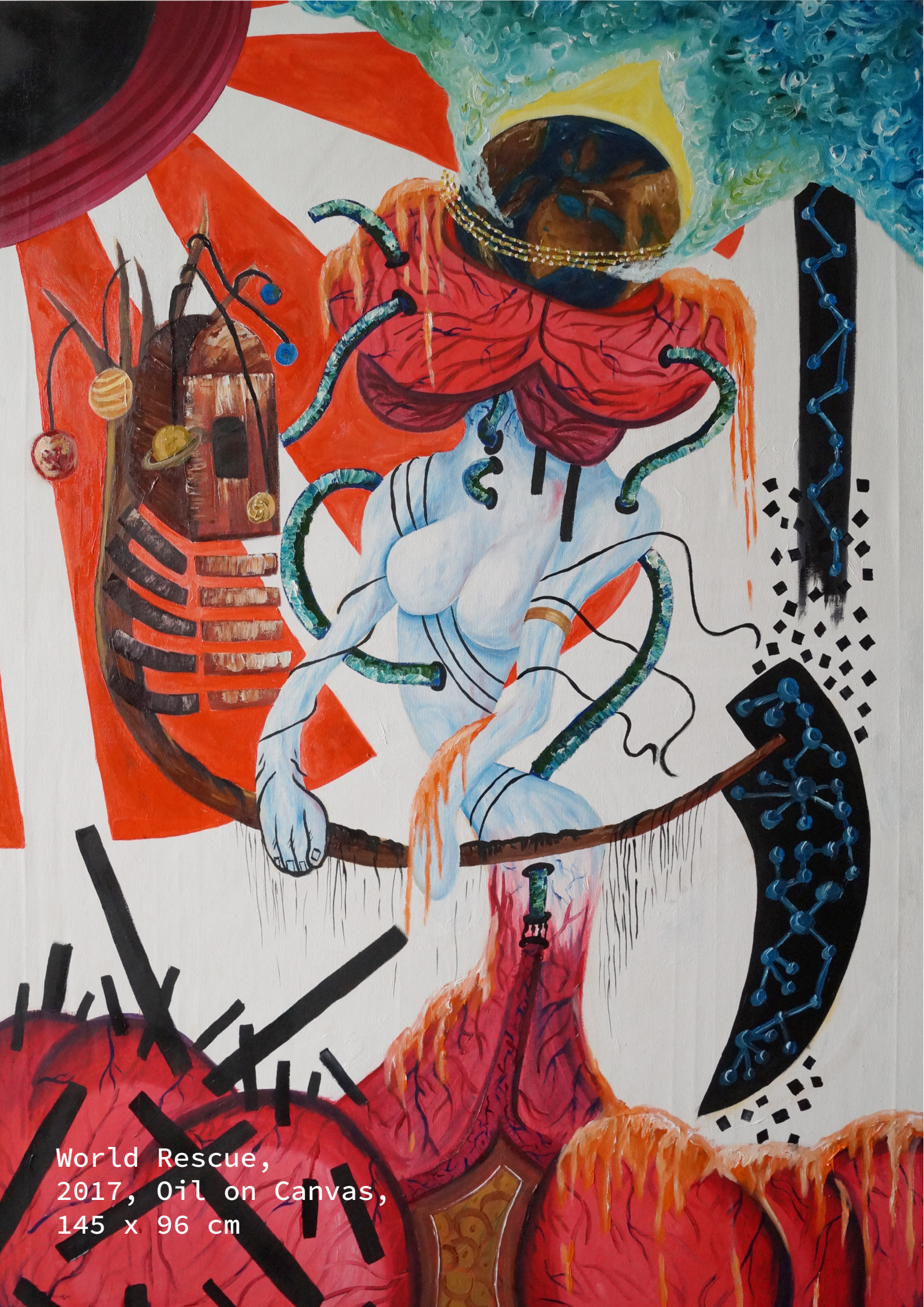
World Rescue, 2017, Oil on Canvas, 145 x 96 cm