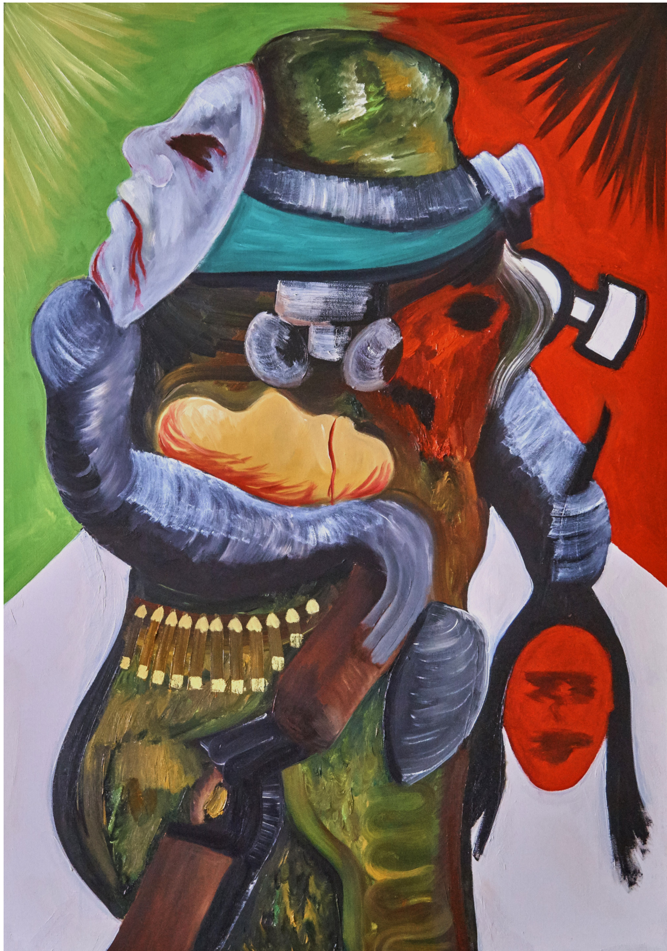
New Hope?, 2015, Oil on Canvas, 100 x 70 cm