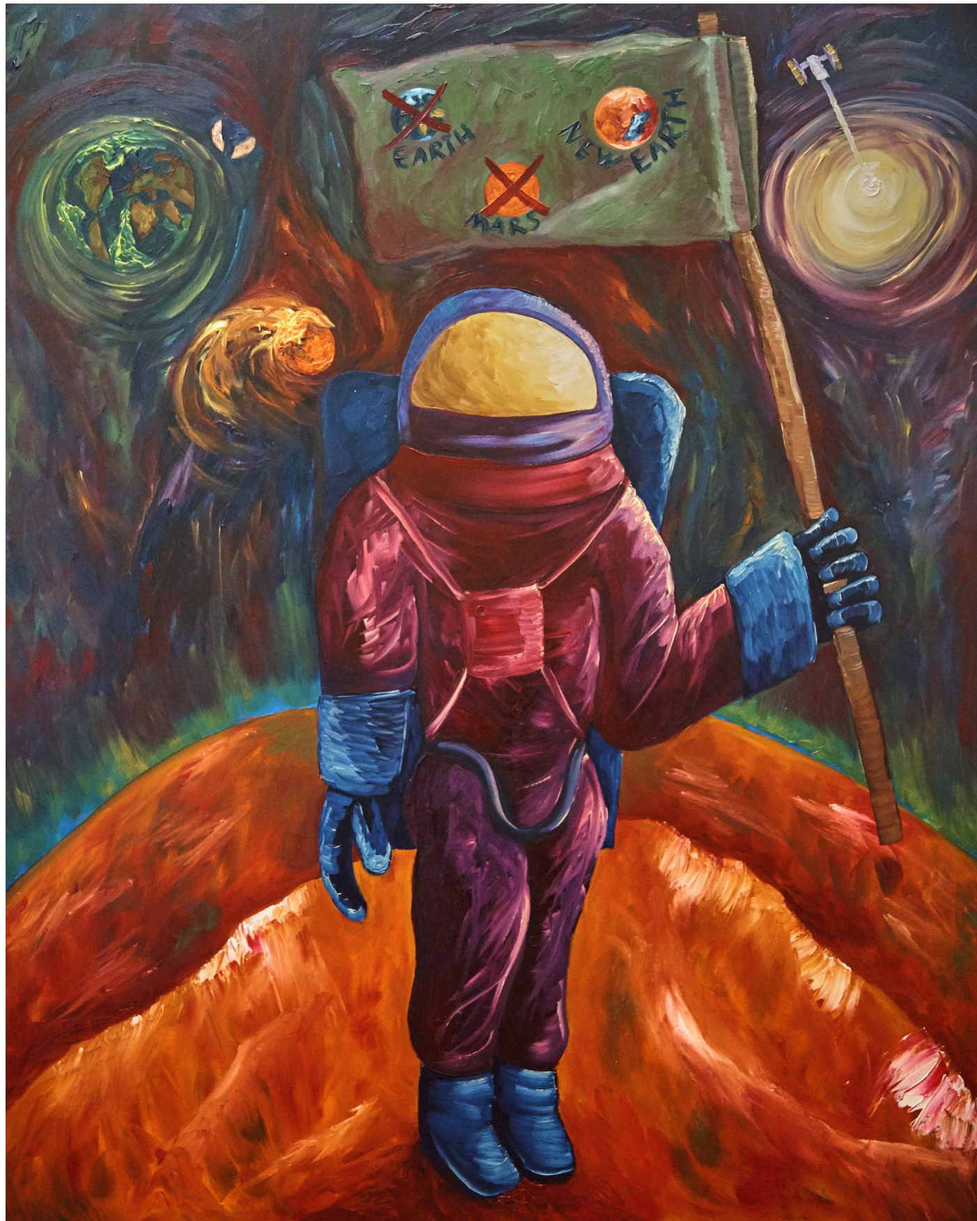
Human Nature, 2017, Oil on Canvas, 100 x 80 cm