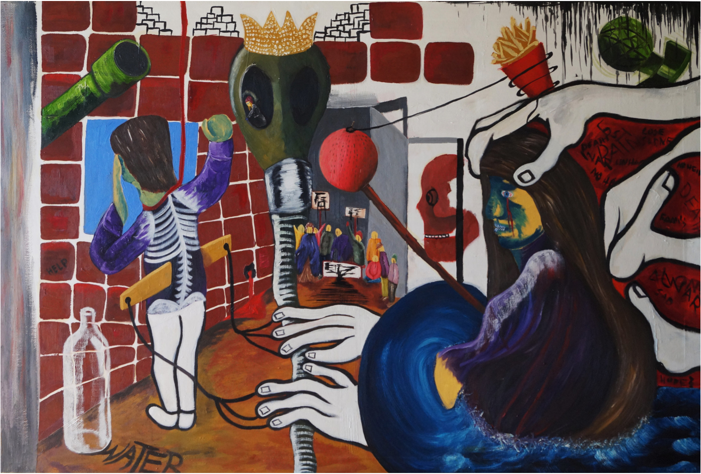
Vicious Circle, 2016, Oil on Canvas, 145 x 96 cm